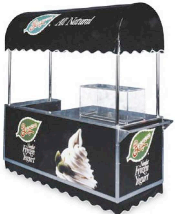
Frozen Yogurt Cart shown with custom awning, graphics and caster skirt.