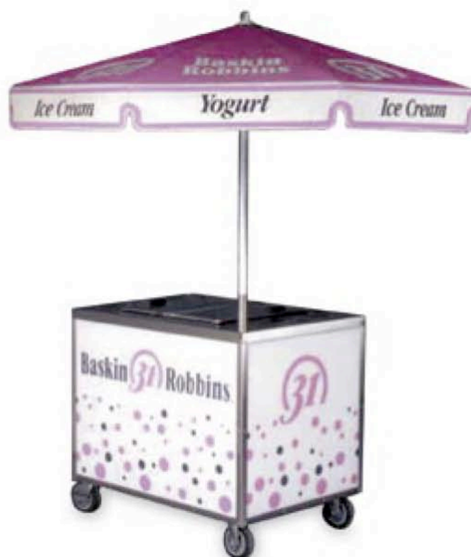
Ice Cream Cart shown with custom umbrella and graphics.