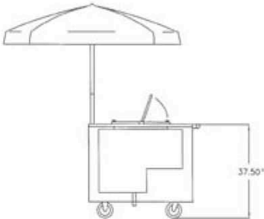
OPERATOR'S SIDE VIEW