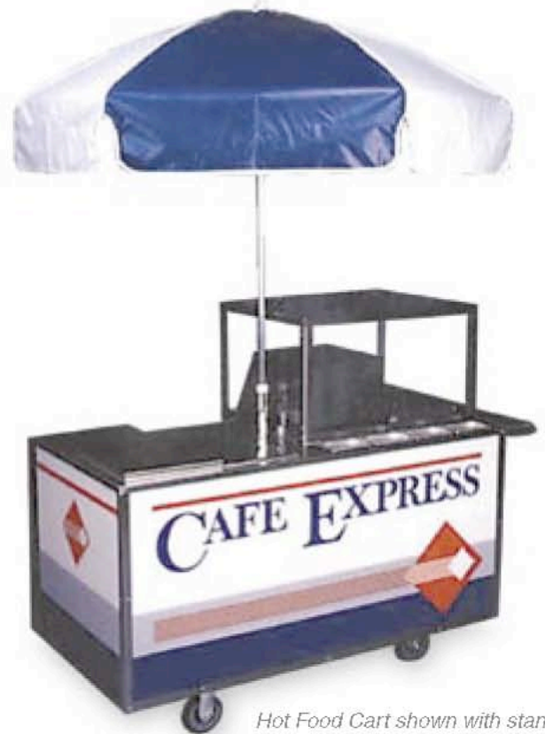
Hot Food Cart shown with standard umbrella and custom graphics.