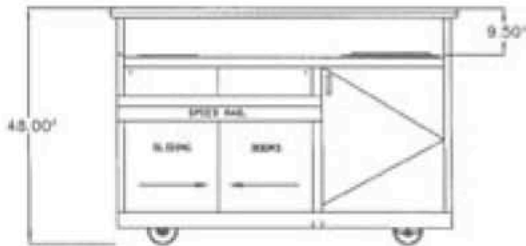
OPERATOR'S SIDE VIEW