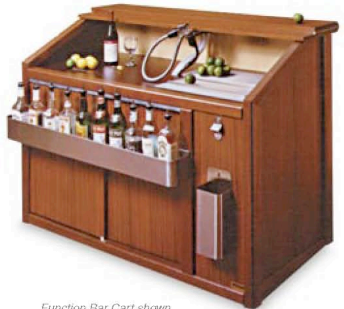
Function Bar Cart shown with optional mahogany panels.